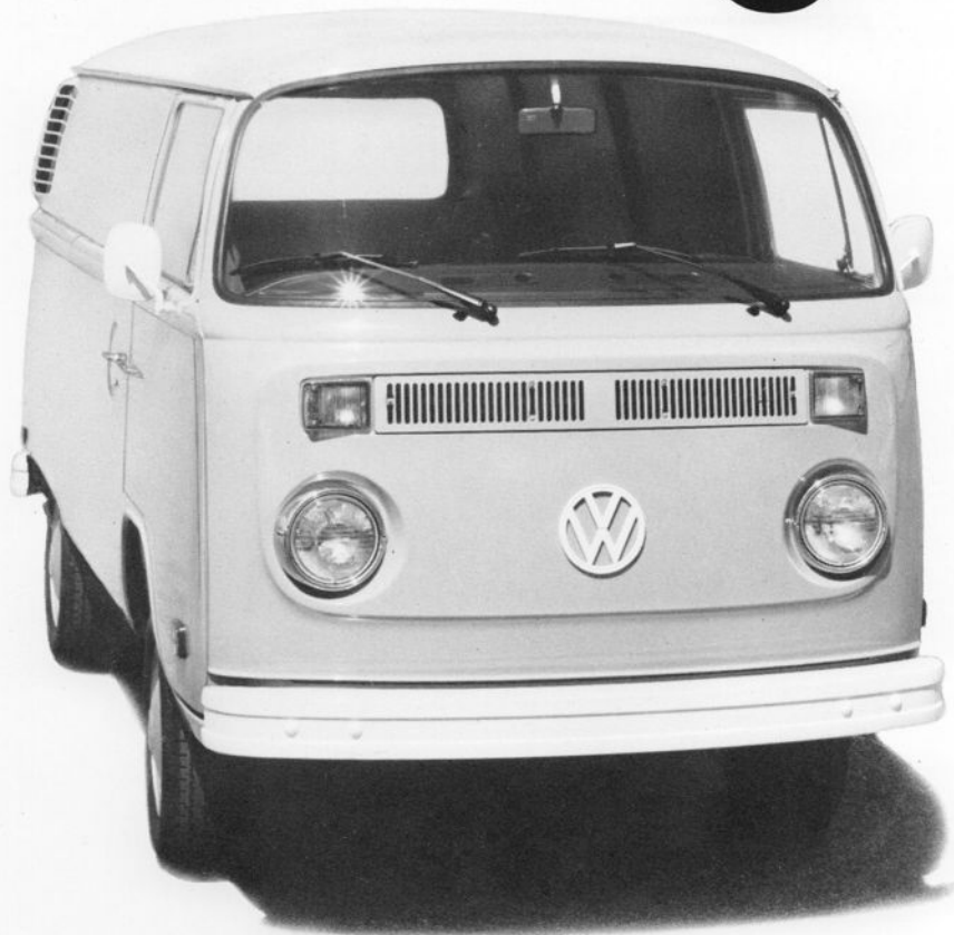
1978 VW Window Van/Delivery Van