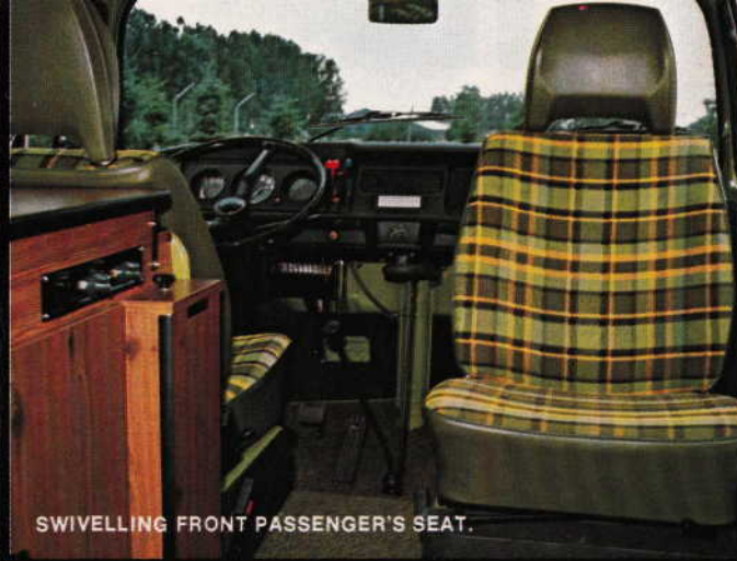
SWIVELLING FRONT PASSENGER'S SEAT.