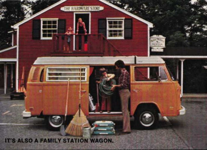
IT'S ALSO A FAMILY STATION WAGON.