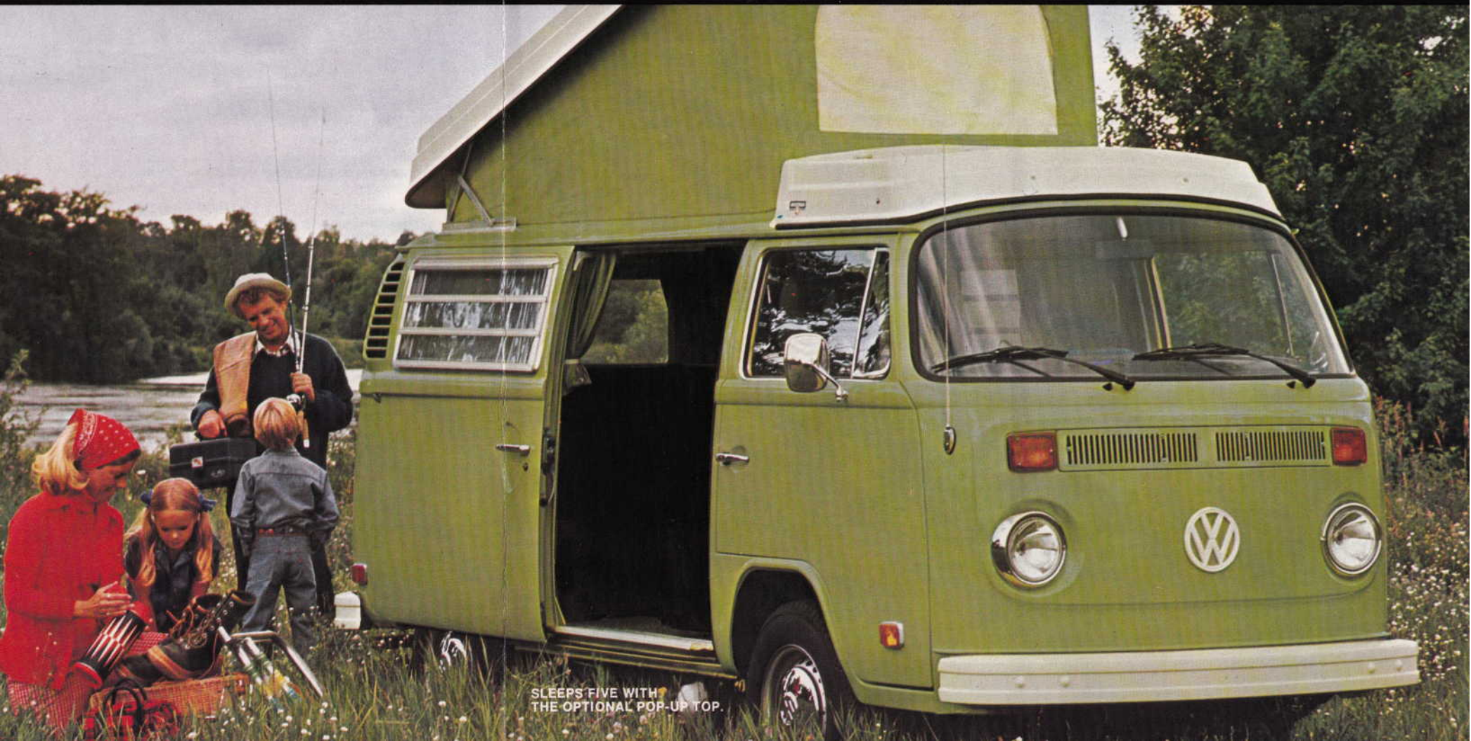
SLEEPS FIVE WITH THE OPTIONAL POP-UP TOP.