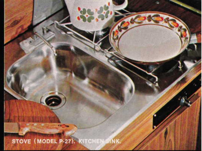
STOVE (MODEL P-27). KITCHEN SINK.