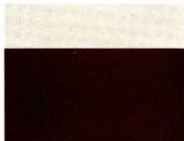
Pastel White Chianti Red