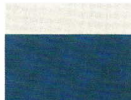
Pastel White Niagara Blue