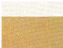
Pastel White Kansas Beige