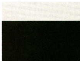
Pastel White Elm Green