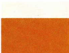
Pastel White Sierra Yellow