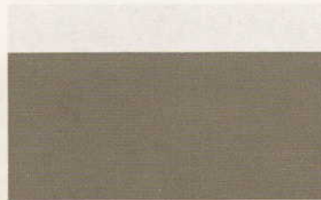
Cloud White Savannah Beige