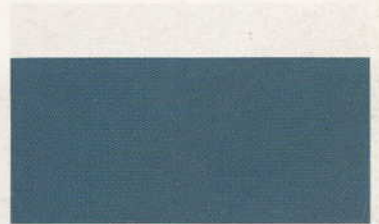
Cloud White Brilliant Blue