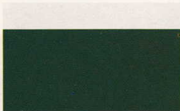
Cloud White Delta Green