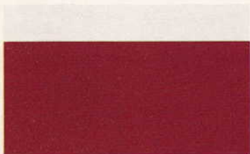
Cloud White Montana Red