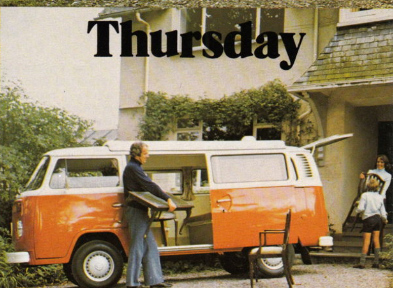
The Devon delivery van