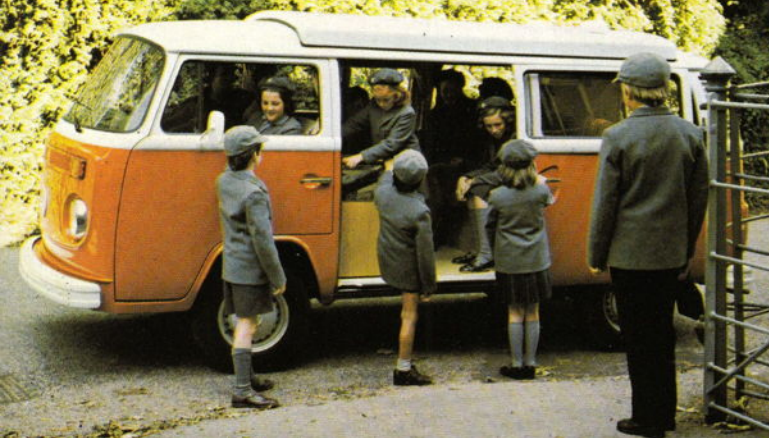
The Devon minibus