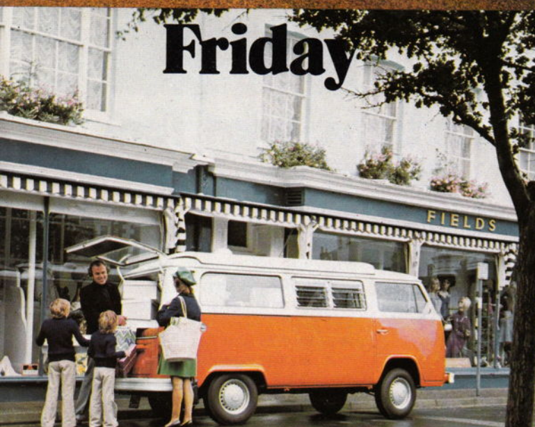
The Devon shopper