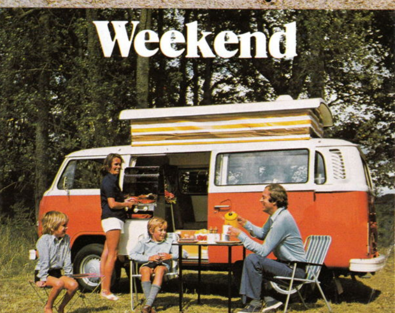
The Devon mobile holiday home