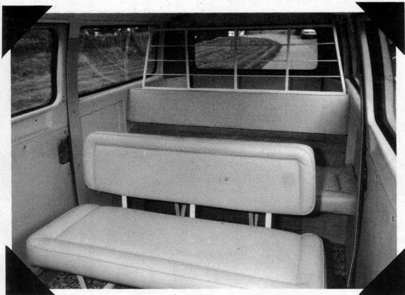
Dad's comfortable seats really do deserve applause.