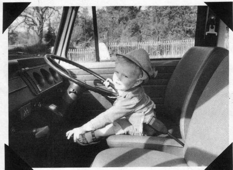
So easy - even a child could drive (if only my legs were longer!)