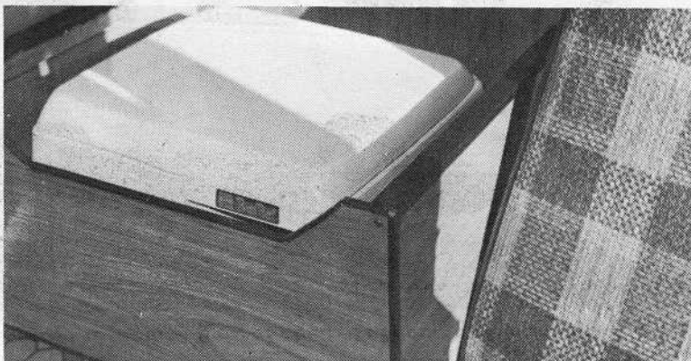
PORTA-POTTI is located under the single rear-facing dinette seat; can be used even when the double bed is down, in sleeping position.

Naturally a long list of options is available. The El Campo may be