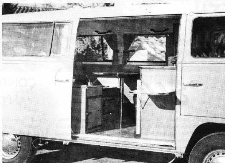
IN NICE WEATHER, cooking is done outdoors with a portable stove set on the handy swing-up table mounted on the side of the ice box, thus keeping fumes and grease out of the unit. On a nasty night, the stove can be moved inside, to the top of the ice box. Sink, water pump and food storage cabinet are seen on the left of the van entrance.