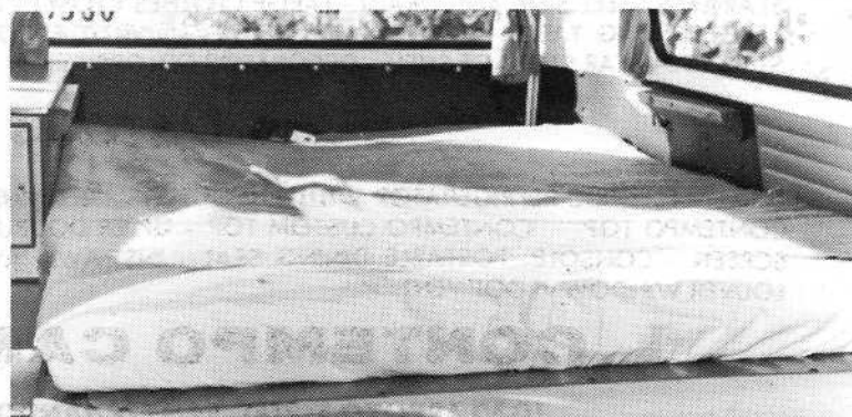
BED is kept made up with sheets and blankets; folds out in a second with just one movement.