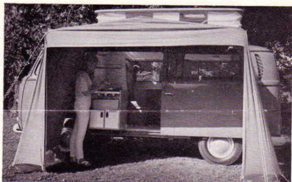
The large attachable awning doubles the accommodation area.

No longer than an ordinary saloon car (and just as easy to handle) it is ideal for day-to-day use all-year-round. Shopping, taking the children to school, travelling on business, picnics in the country . . . it takes everything in its stride without any problems. A Devon Motor Caravan thrives on the busy life and its economical performance doesn't put an undue strain on the family budget.