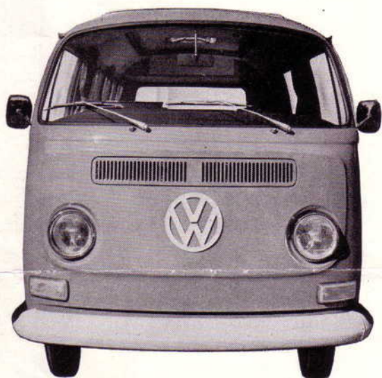
The new Devon Motor Caravans have a one-piece wind-screen.

Here's a vehicle that has everything and does everything