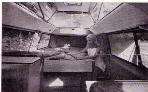
Full-size double bed (over 6 ft) slides out from rear storage position and still leaves ample floor space.

Additional features on the 'CARAVETTE' and 'EUROVETTE' include: ● 7 gallon plastic tank with water pump ● Melamine crockery for four persons ● Stainless steel cutlery for four persons ● Built-in fluorescent lighting ● Luxurious internal trim ● And (on 'EUROVETTE' only) ● Built-in sink unit ● Two-burner cooker with grill and spacious oven ● And other special de luxe fittings. The newly-designed 'straight-up' DEVON Elevating Roof (fully insulated and head lined) is available on all models at an extra charge of £100 and an additional hammock bunk can also be fitted in this roof area as a further optional extra.